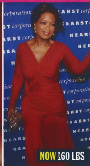
NOW 160 LBS