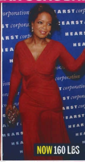
NOW 160 LBS