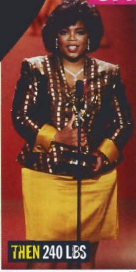
THEN 240 LBS