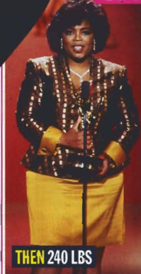
THEN 240 LBS